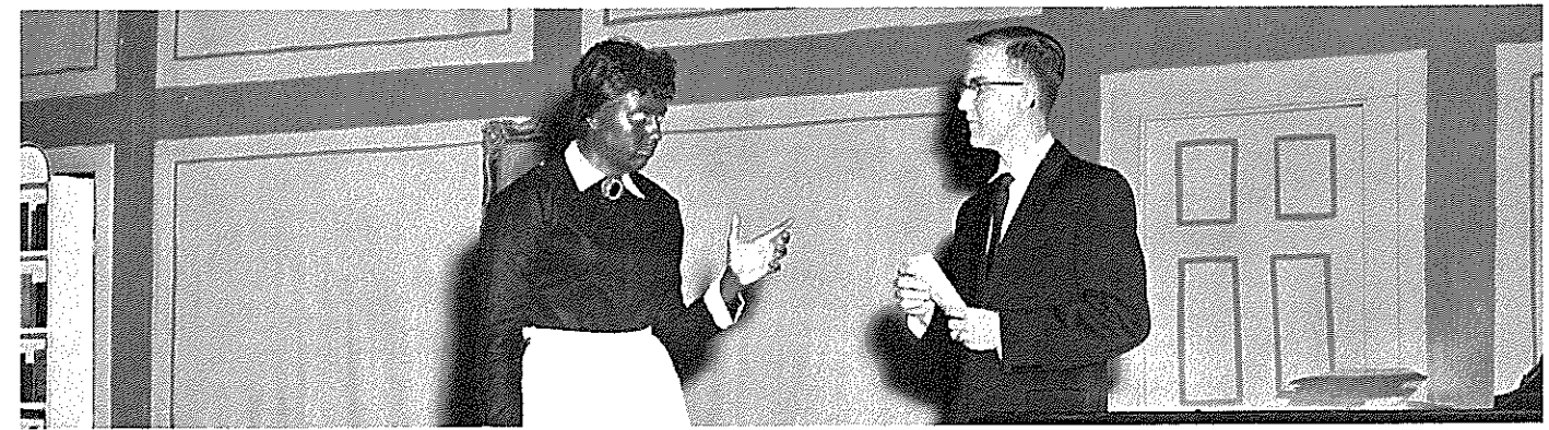
CAT AND THE CANARY