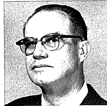
Hamilton Still Mathematics