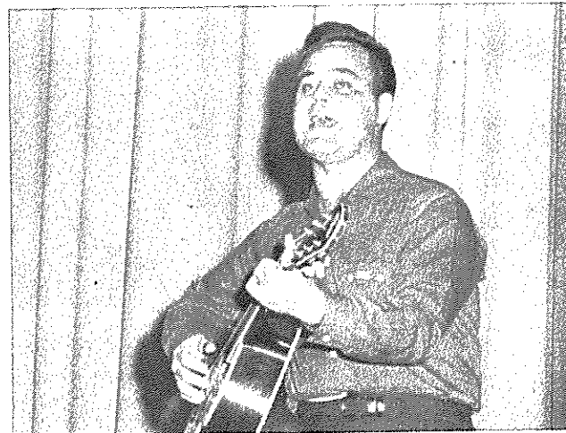
The center of entertainment!!