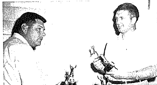
The coaches admire their trophies.