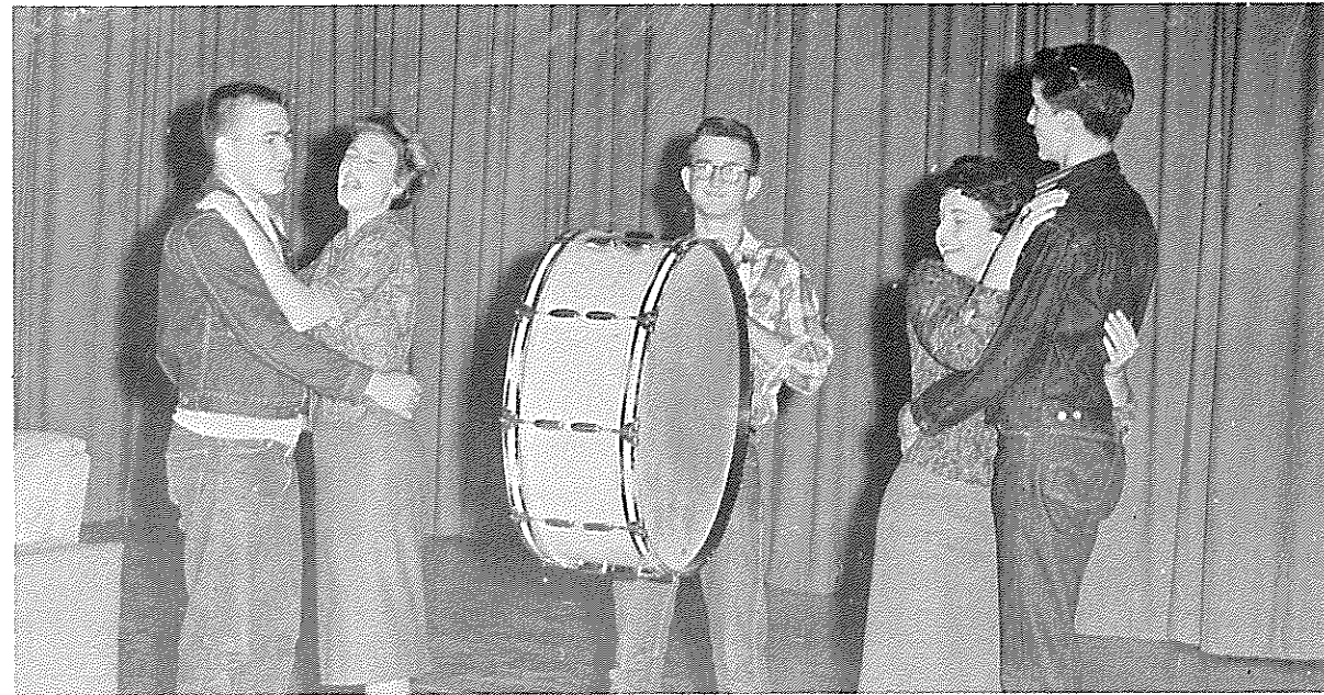
Little brother can really mess things up.