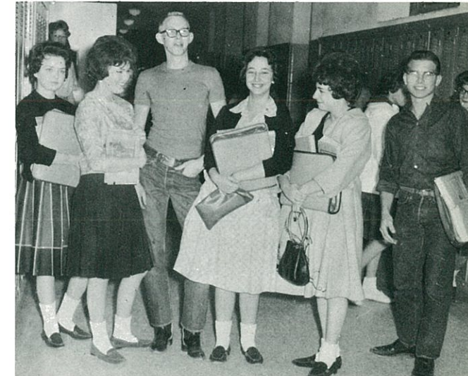
A noble senior tells the lowly freshmen to "obey."