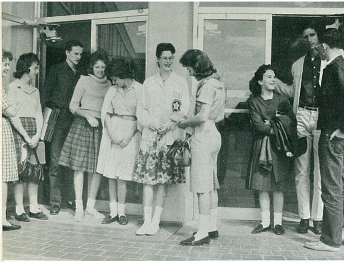
Students wait for the bell to ring after the lunch hour.