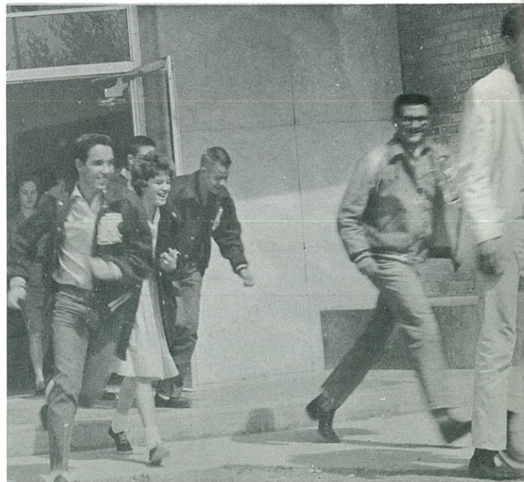
Students make a mad dash to the cafeteria to avoid the noon rush.