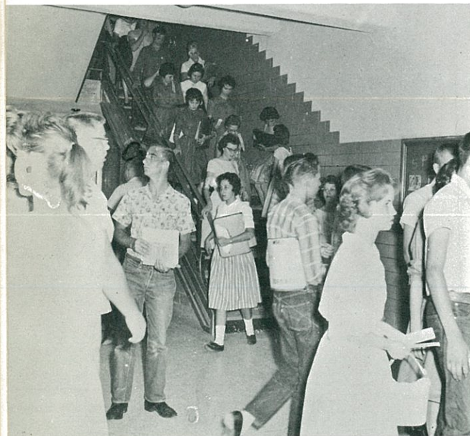
Students rush to pep rally.

The freshman and senior years are probably the two most important high school years to a student. In the freshman year, he looks ahead and has his high school life before him; while in his senior year, he looks back and can remember an important part of life.