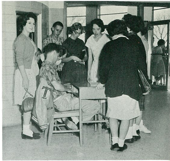
Students engage in one of the many club activities.