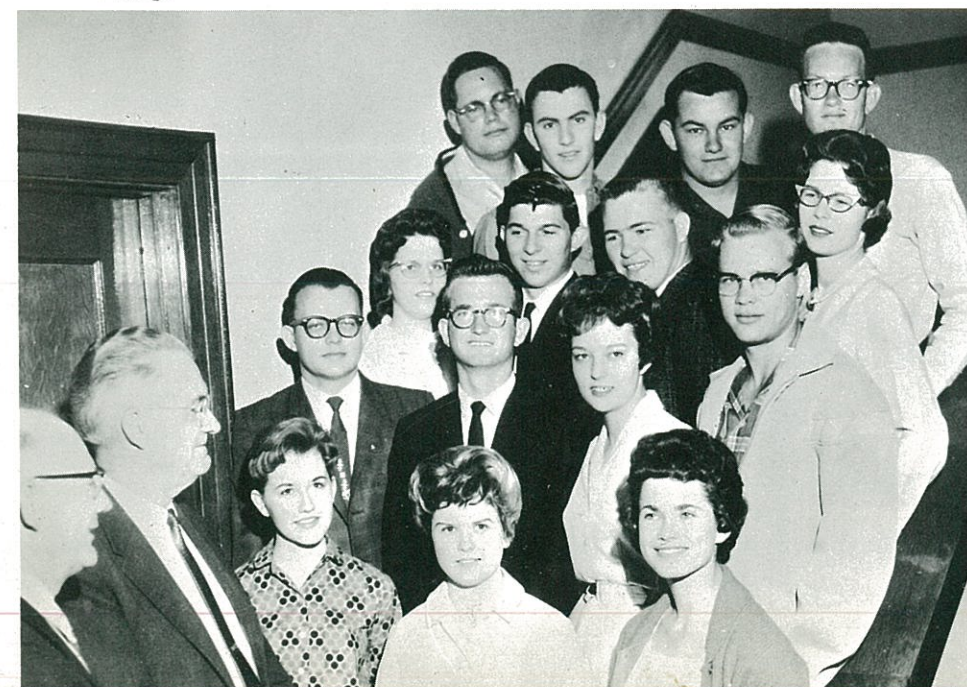
The elected officials for the day were sworn in by Judge Cook.