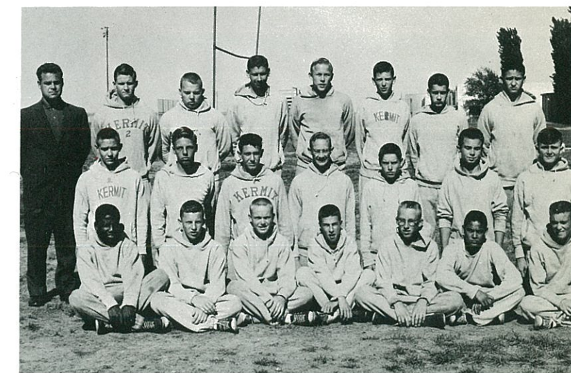
The Freshman Track Team lost only one track meet during the season.