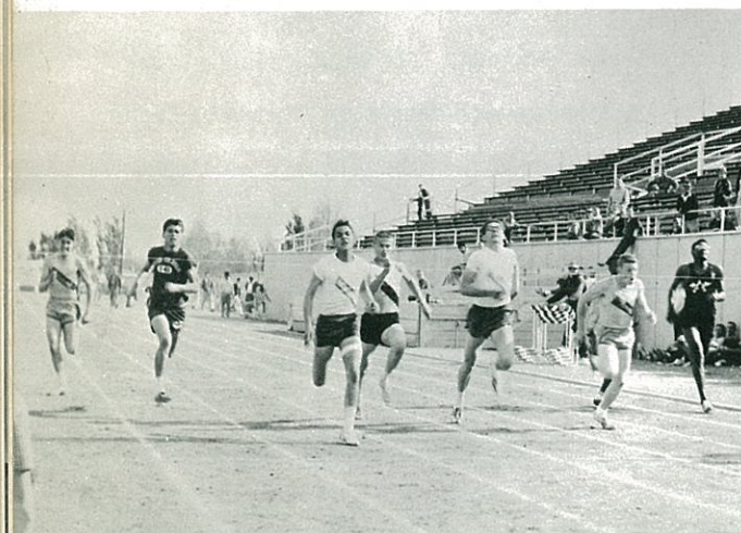
Two KHS freshmen run in the 75-yard dash at the district track meet.