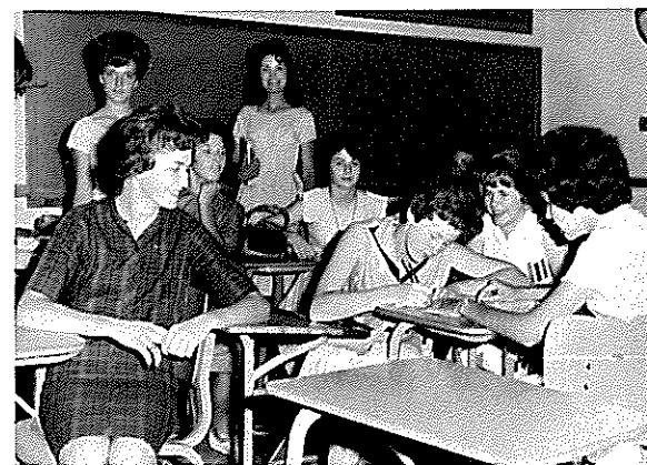
Press Club has their last meeting.