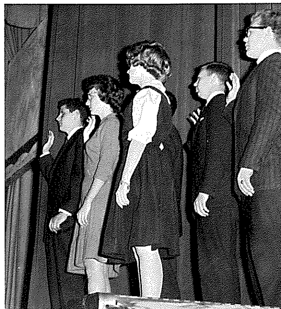
New Thespians are sworn in.