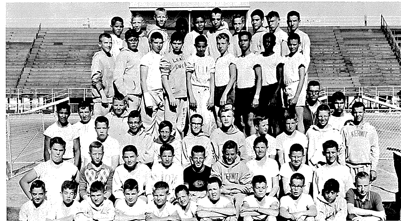
7th Grade Track