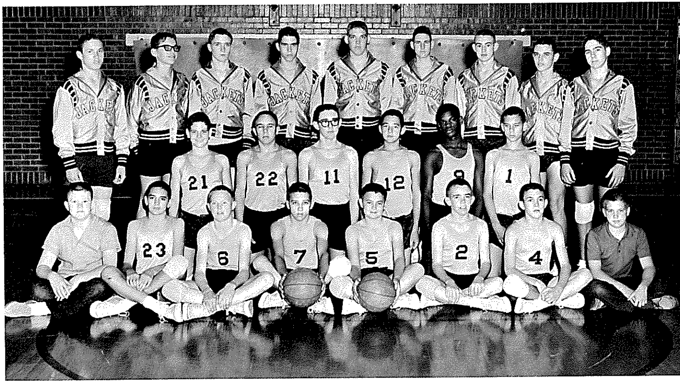
8th Grade Basketball