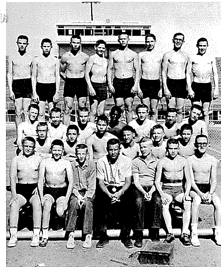
Jr. High Track Teams