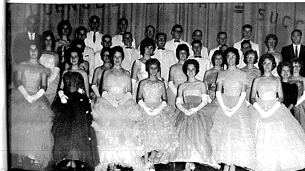
Members stop and pose for picture.