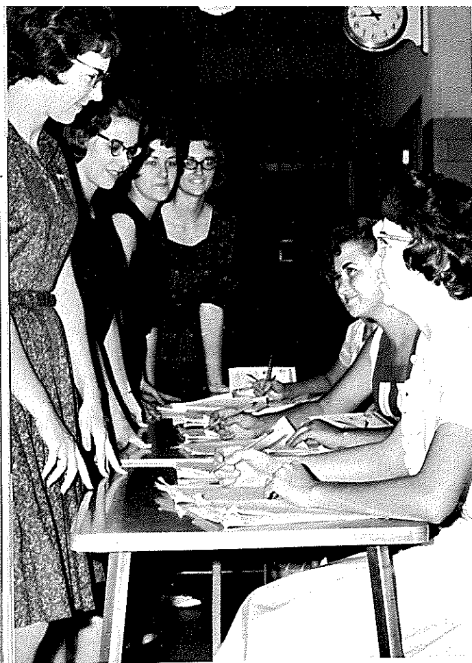
Seniors anxiously register for their last year.