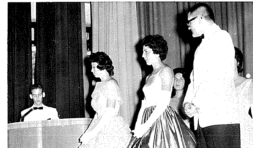
Officers are sworn in.