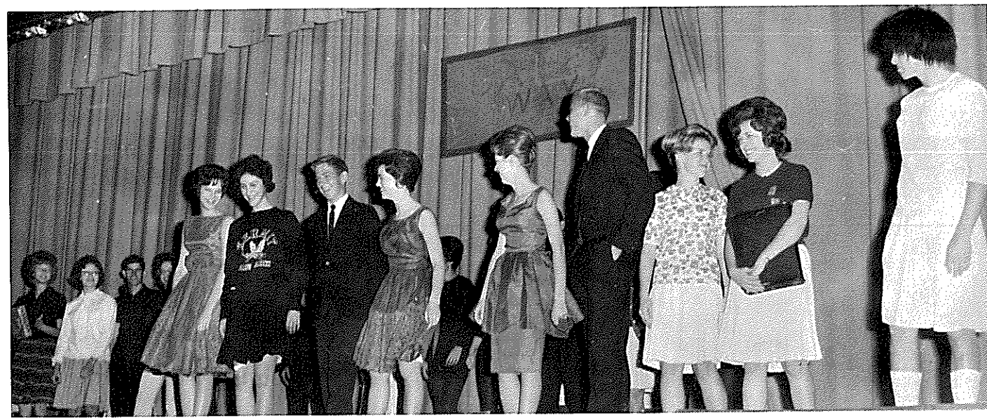
All members join in to sing the closing song of the program.

The sponsor of the production was Dawson's Wax. That Wonderful Year was presented and the program was closed as all Sophomores on stage sang 'Do You Recall That Wonderful Year.'