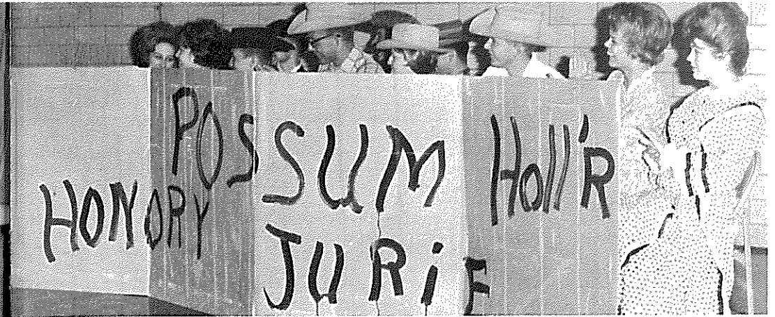
The honorable jury pronounces the verdict, "guilty."