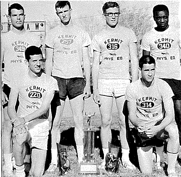
Jackets pose with trophies won at the Seminole Relays.