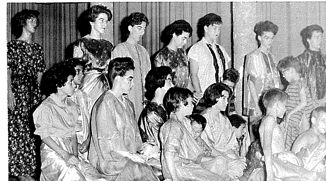
The wives and children of the "King" listen as the Ruler-Father gives instructions about the visiting English teacher.