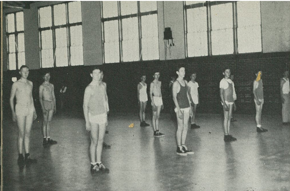
The Physical Education Department provides an outlet for the energy of the students. Here instructions are offered in basketball, football, tennis, and calisthenics. Here the ideals and practices of good sportsmanship are promoted.