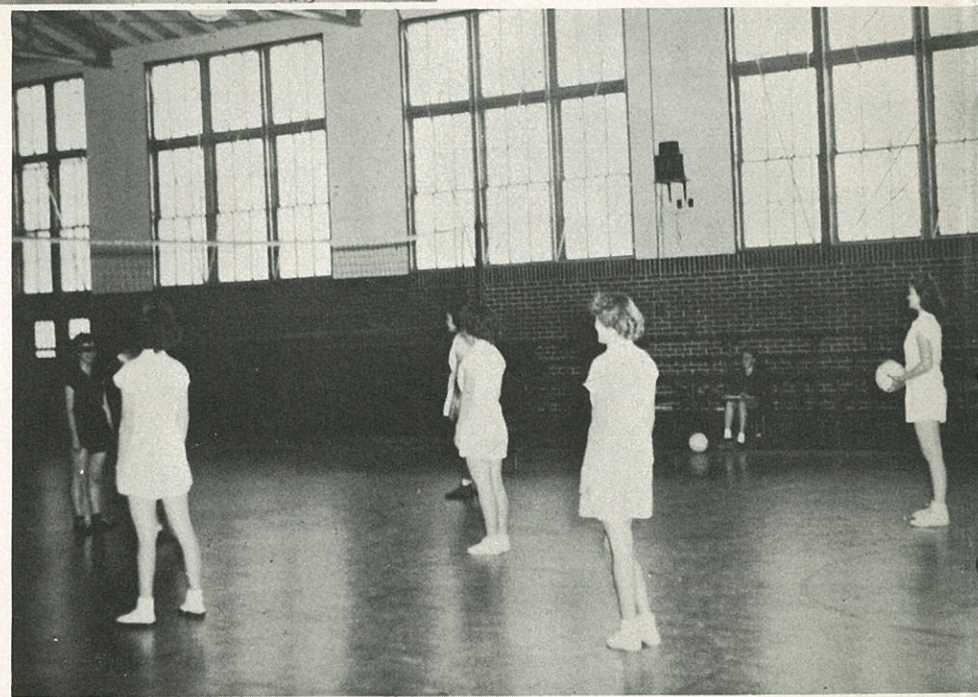
The girls of KHS receive pointers in volleyball, baseball, tennis, pingpong and archery. Class lectures include a detailed study of social hygiene as well as highway safety. Here the girls learn to work together and play together.