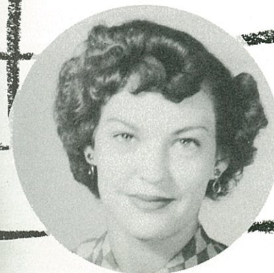
LA JUAN HOLT Song: Maybe