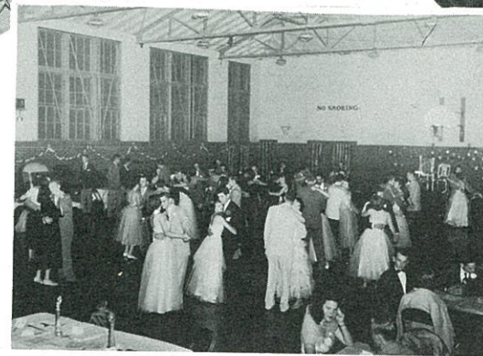
WINTER WONDERLAND BALL