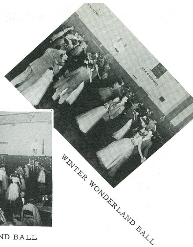
WINTER WONDERLAND BALL