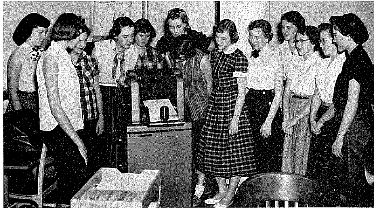
Using the Electric Mimeograph Machine