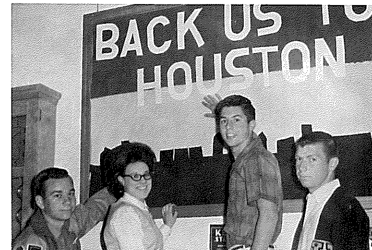
Student Council officers win support of school with this display.