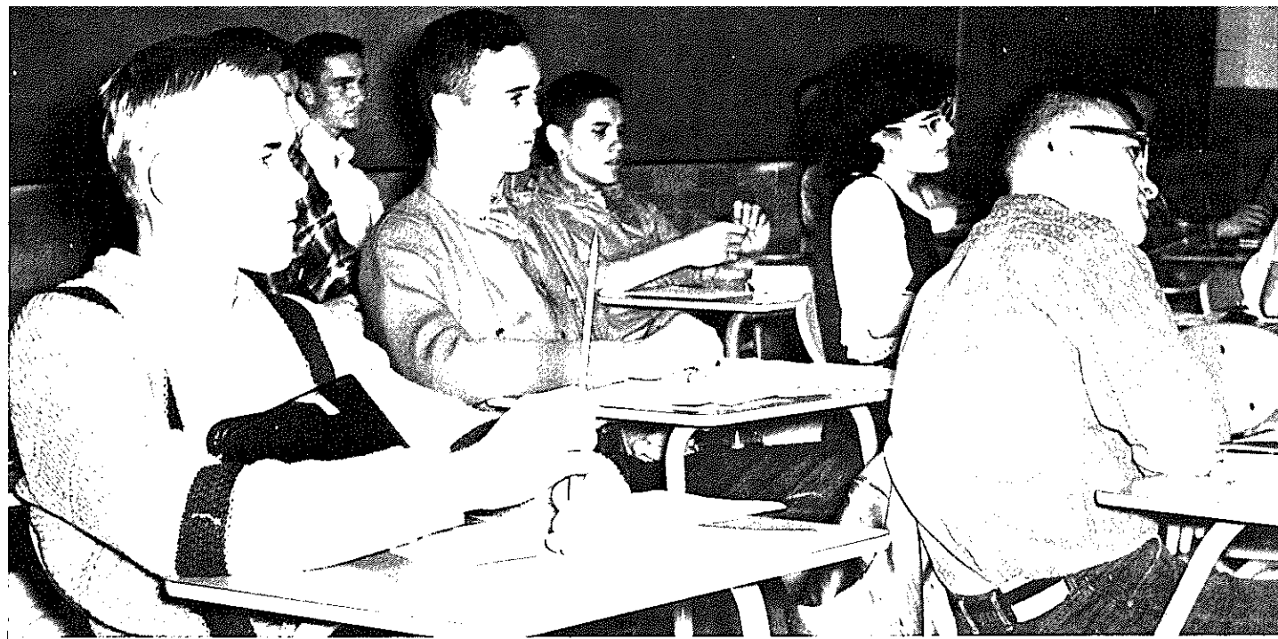
In the morning classes Seniors are bright and attentive...