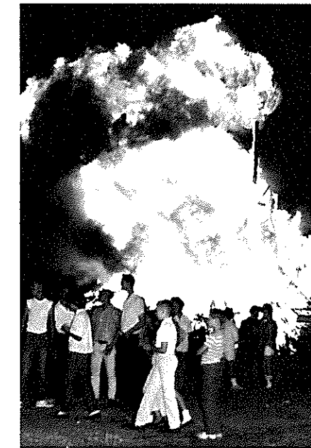
Anybody bring the marshmallows?

The students work hard in order to finish the bonfire on time.