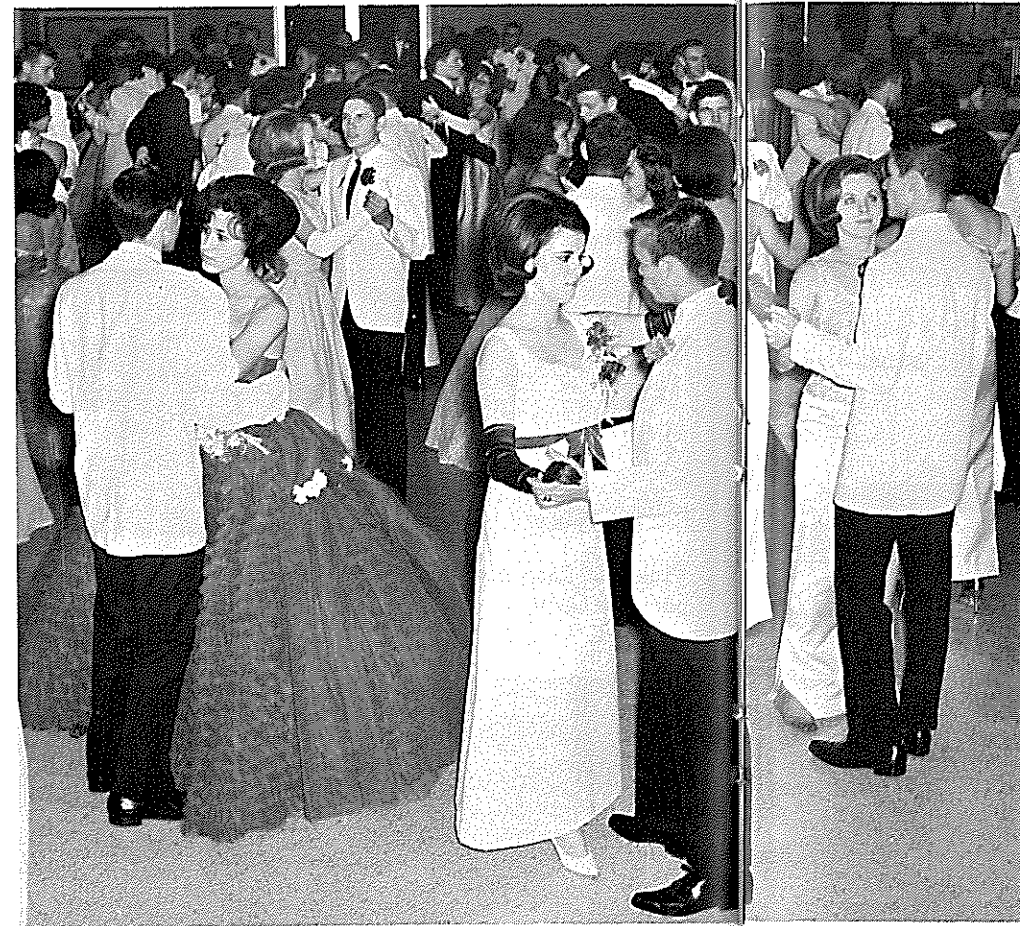
Students crowd the dance floor as they dance to the music of the Lancers.

After the crowning of the King and Queen the Lancers played until midnight.