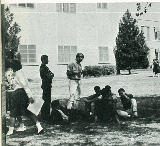
A group of seniors loosen the tension of the day by resting in the shade of the trees.