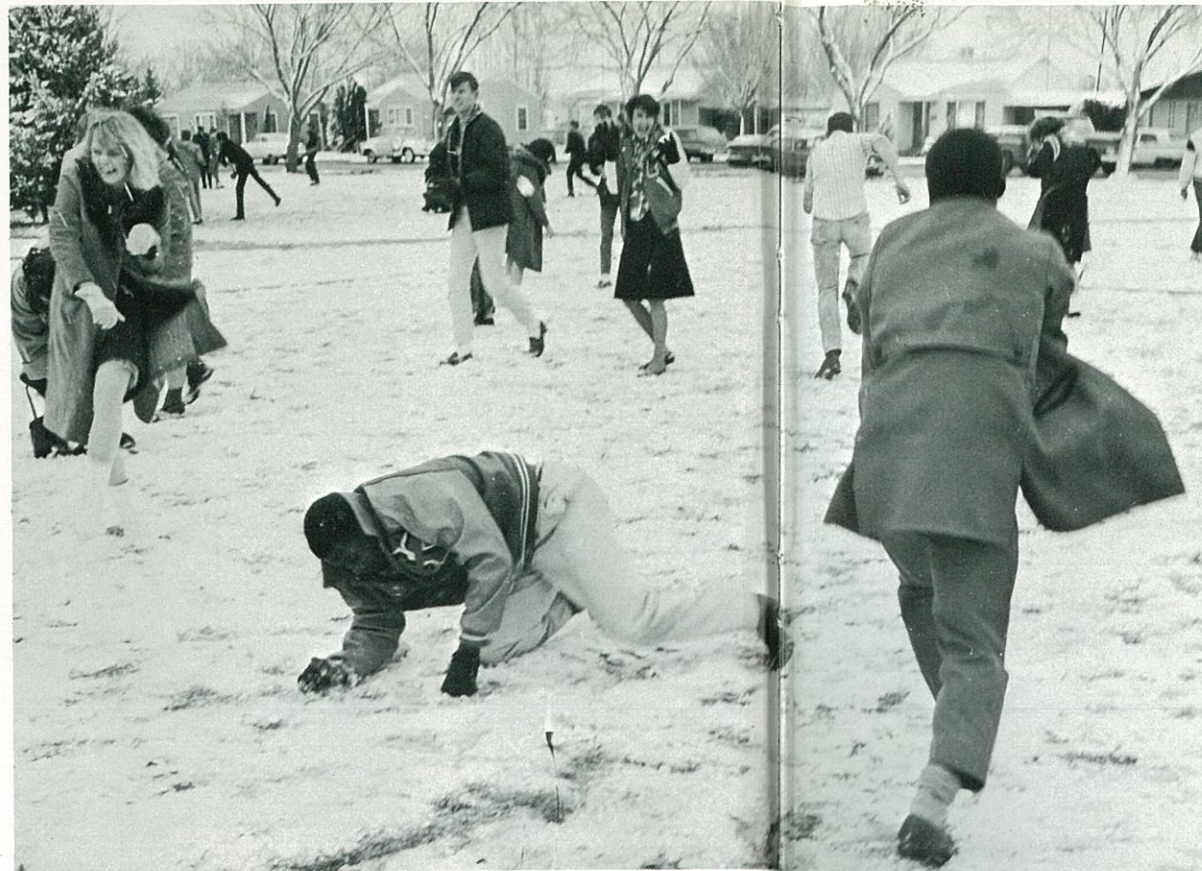
During the lunch hour, snowballs fly over the campus.