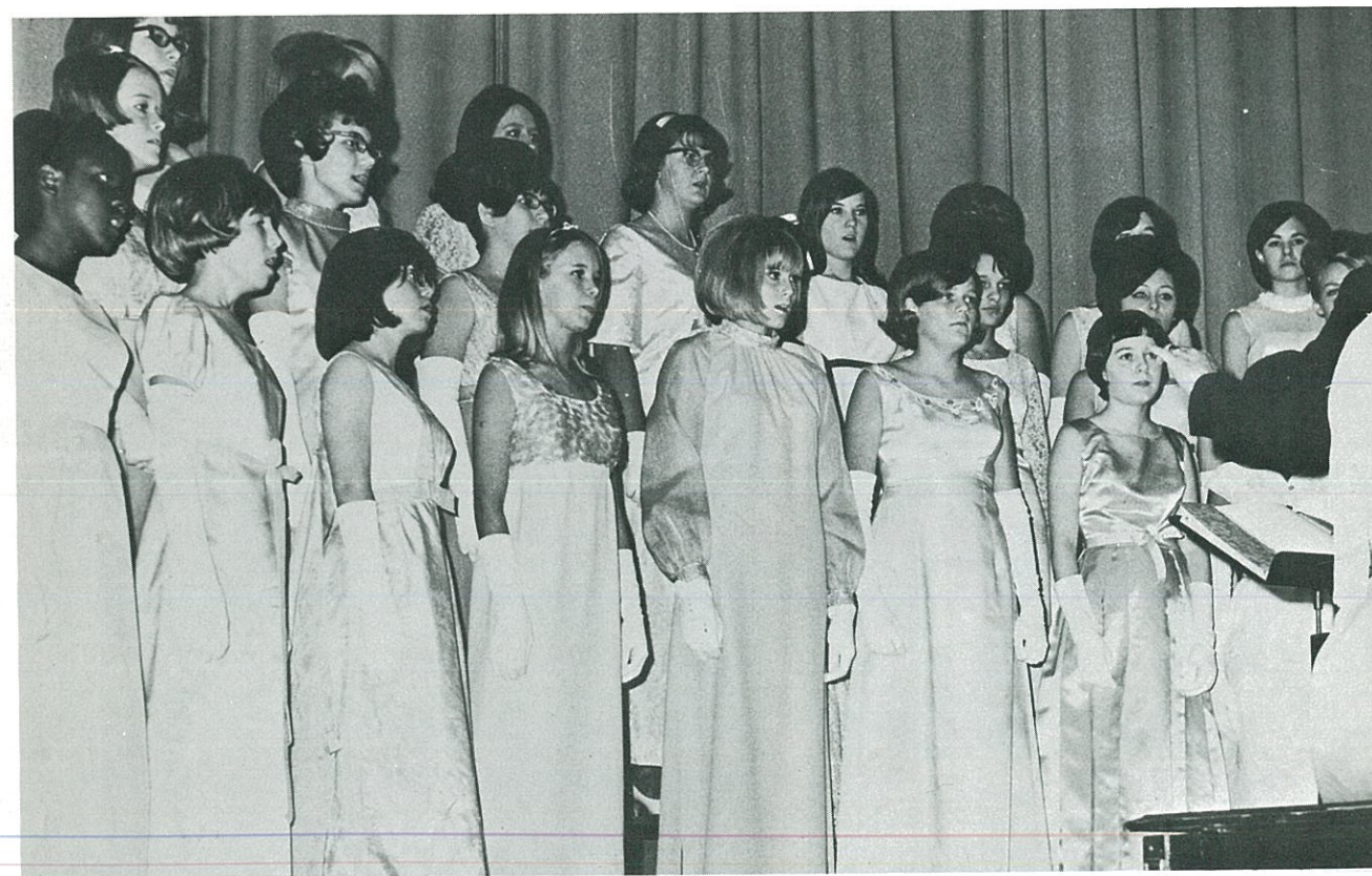
The Freshman Girls' Choir sings in a concert.