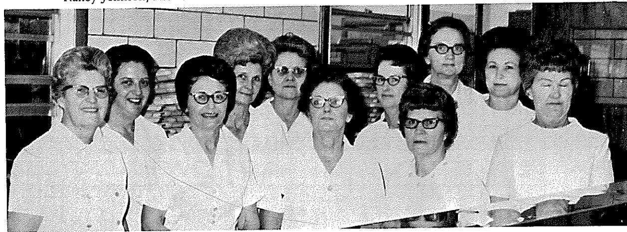
High School Cafeteria Staff