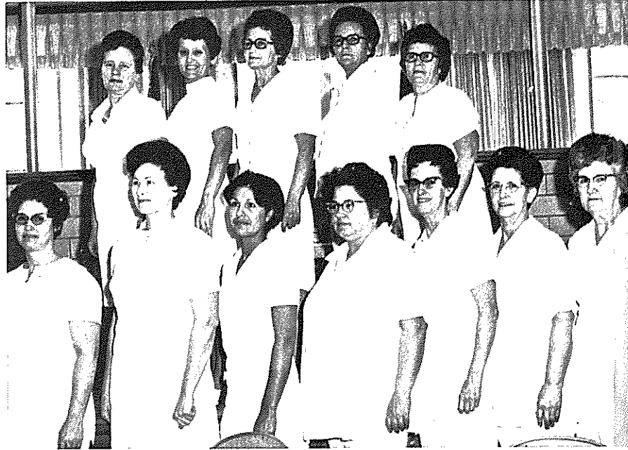
High School Cafeteria Staff