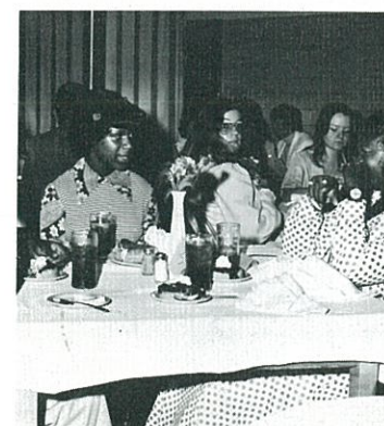
I love food!