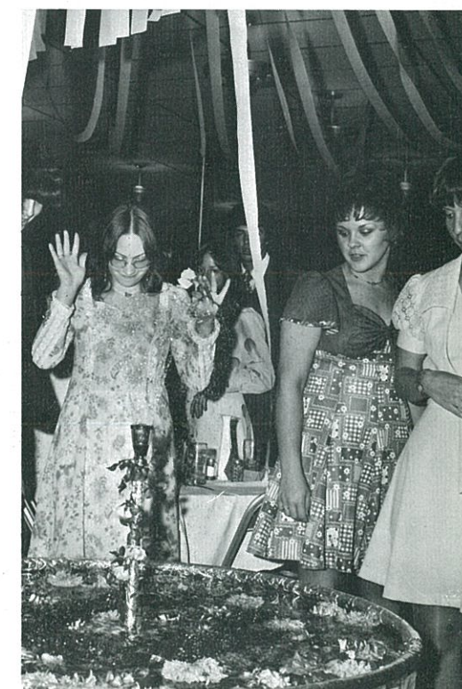
Let there be water!