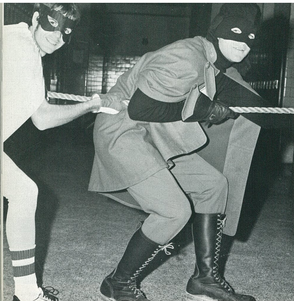
Holy Toledo! The Dynamic Duo!