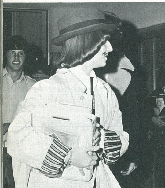
Say the correct word and I'll give you a hundred dollars.