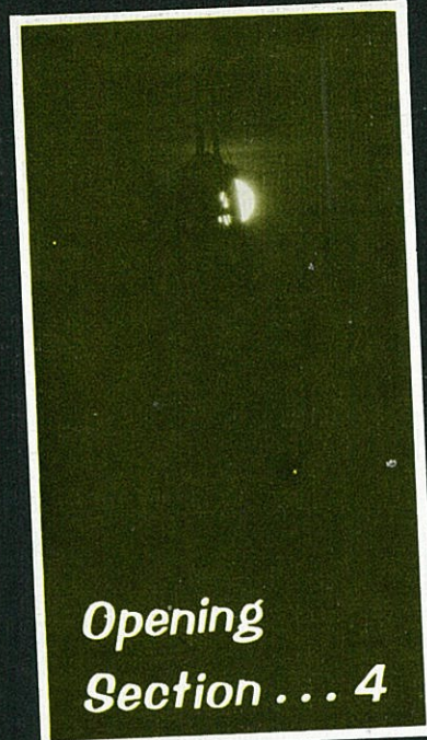
Opening Section . . . 4