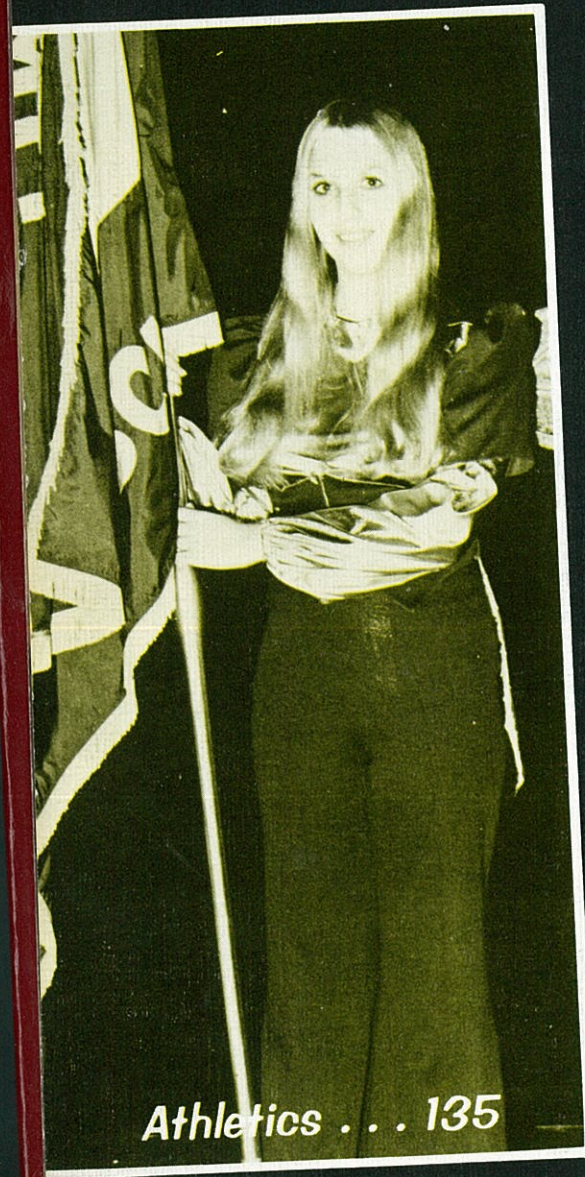
Athletics . . . 135