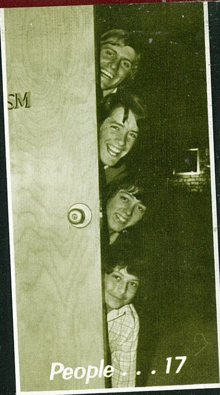
People . . . 17