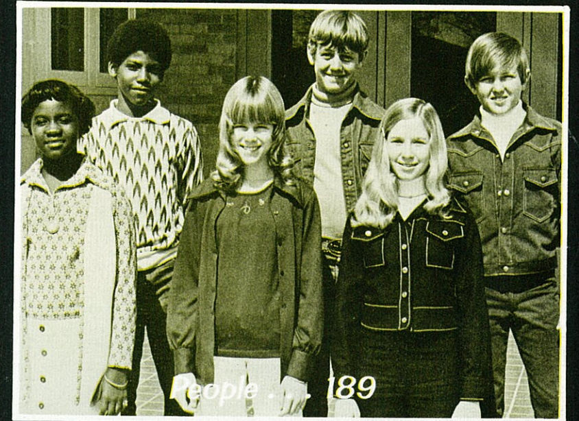
People . . . 189