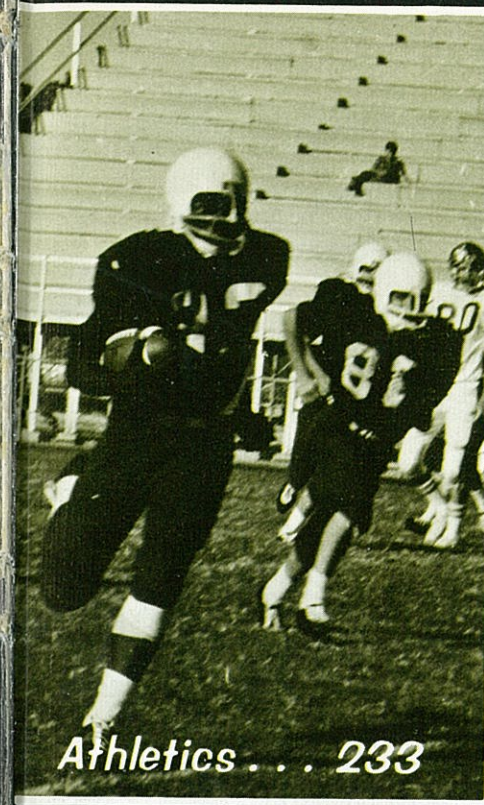
Athletics . . . 233