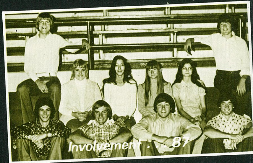
Involvement . . . 87