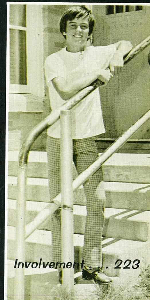
Involvement . . . 223