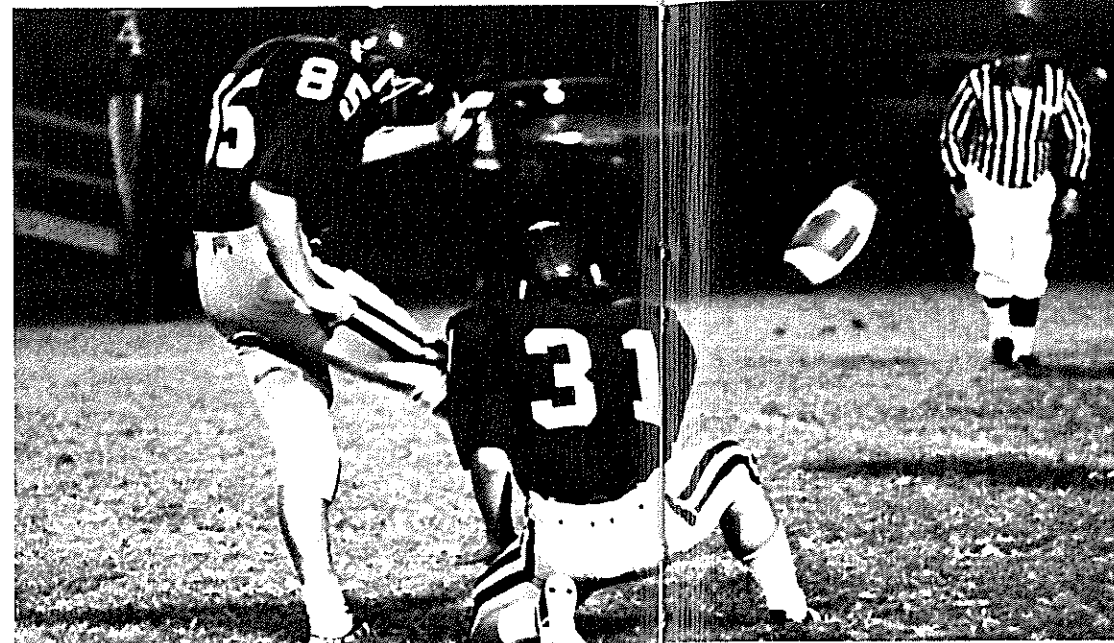
King adds the P.A.T.