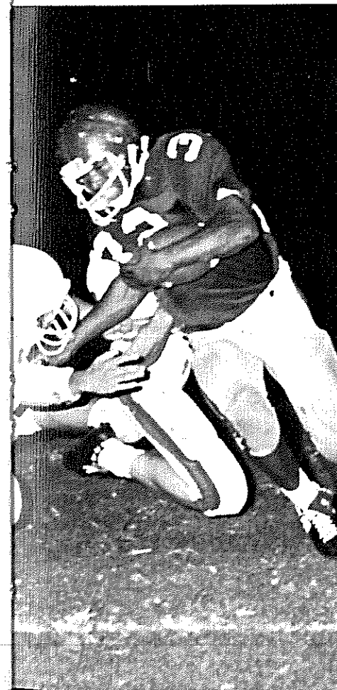
Hawk gains yardage against Crane.