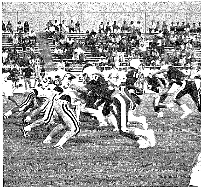
Strong defense holds Alpine.