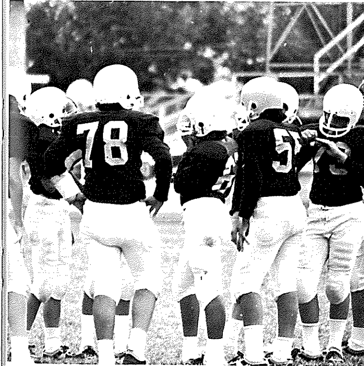
Junior Daubers get in their huddle for the next play.