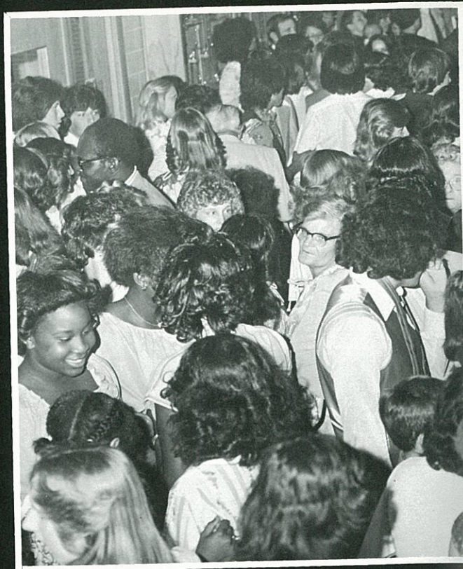
After the ceremony the lobby is always packed with graduates, parents, friends and loved ones.