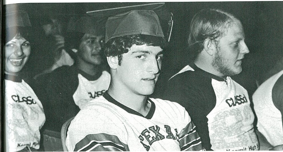
As usual, it's hard to concentrate on directions for the processional and other activities on Senior Cap Day.