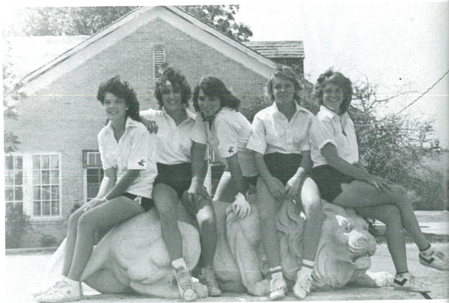
KHS Girls golf team is shown relaxing after the state tournament in Austin.

The locals finished in a second place tie at Regional which they won on the second hole of a sudden death play off. This second place finish at Regional allowed them the chance to play at the State tournament for the eighth year in a row. This is a remarkable feat and one that the girls take a great deal of pride in.