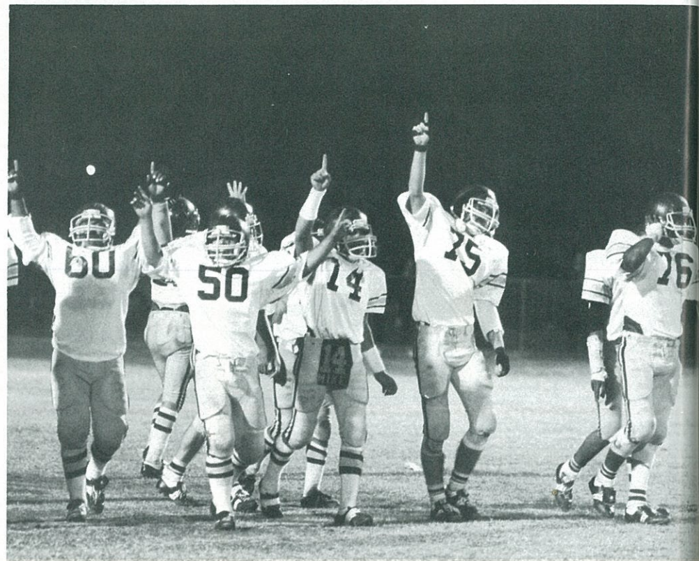
And the Kermit Yellow Jackets for 1984 are DISTRICT CHAMPS as they collected a perfect 9-0 season and the District 4-AAA Championship. Above, the Jackets indicate their spot.

The 1984 Yellow Jacket gridiron season opened and closed against the same foe: the Post Antelopes.