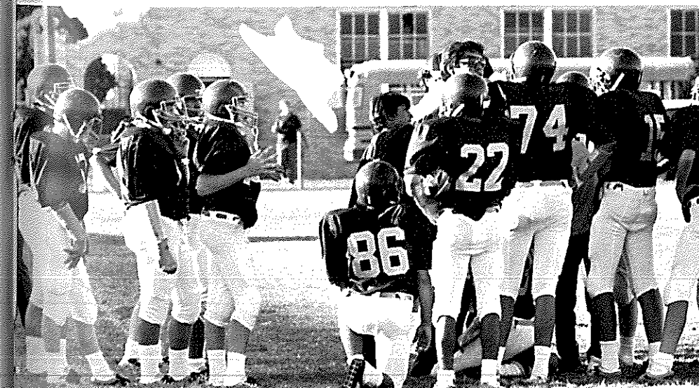
The KHS freshman squad takes advantage of a time-out to get a quick breather and sip of water from the managers.