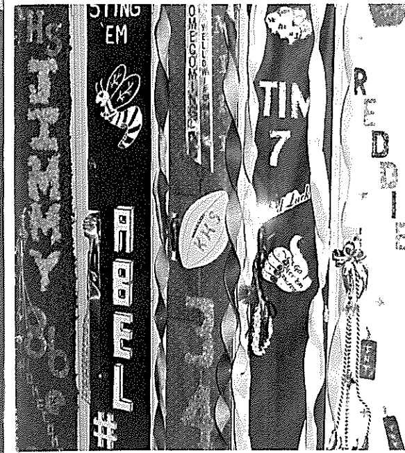
Locker decorations adorned the halls of KHS during homecoming week and some girls became extremely artistic while decorating the football players' lockers.