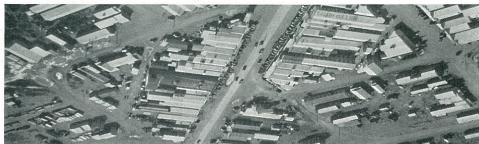
WINK FROM THE AIR