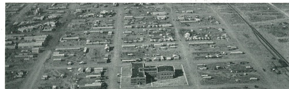
AN AIR VIEW OF WINK