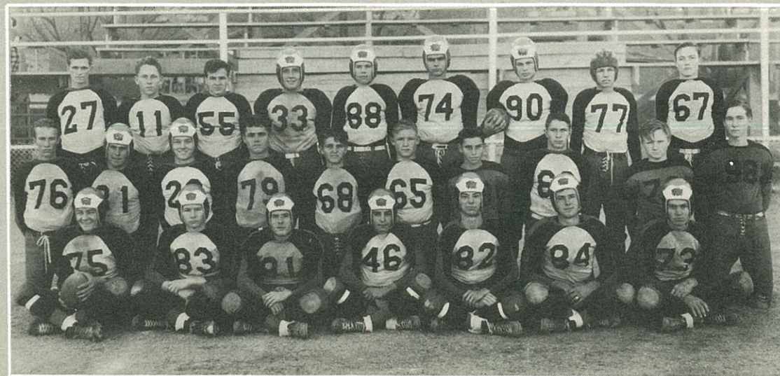
1938 REGIONAL CHAMPIONSHIP SQUAD

POWER TO THE 1939 EDITION OF THE WILDCATS. IT IS THE WISH OF THE STAFF THAT BEFORE THE FINAL GUN OF THE 1939 SEASON HAS SOUNDED THE STRING OF TWENTY-FOUR VICTORIES WILL HAVE BECOME THIRTY-SIX.