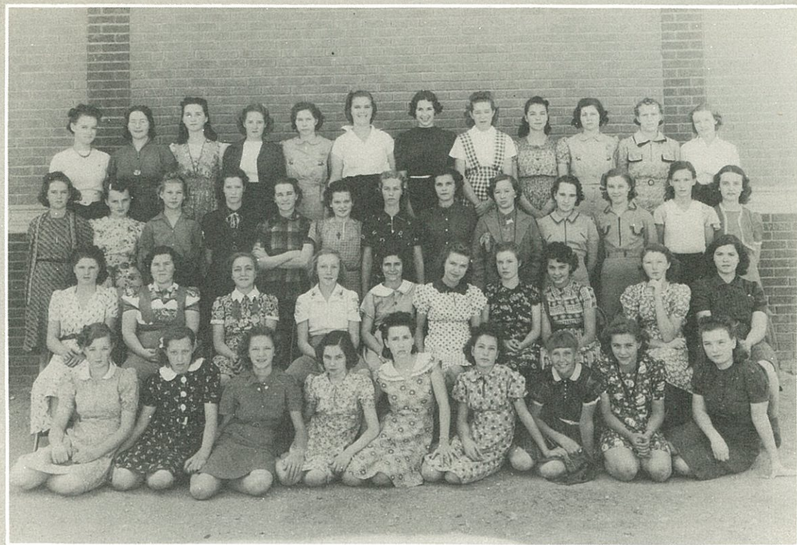
HOME ECONOMICS CLUB

ACE ATHLETE...GLEE CLUB...NATIONAL HONOR SOCIETY...WILDCAT STAFF...DEPENDABLE...A STUDENT...HAS THAT "DON'T LET GIRLS BOTHER YOU" ATTITUDE...HANDSOME...ACE SECOND TENOR...A GENTLEMAN...PLANS TO GRADUATE NEXT YEAR.