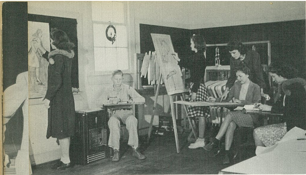
An Art Class

Our art department is still young, yet it is definitely growing. Our students find the art course to be functional, beautiful, and inspirational.