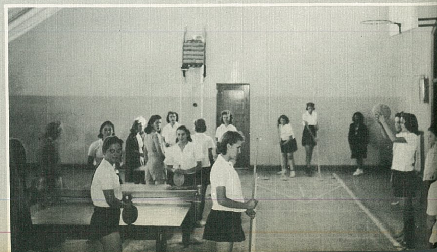
The girls enjoy P. E.