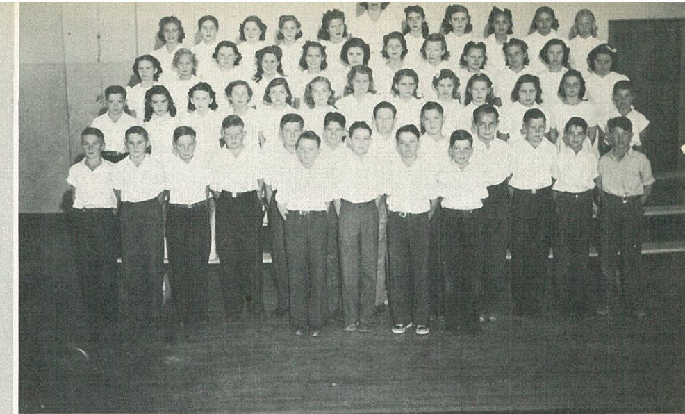
Junior Mixed Glee Club

The Junior Mixed Glee Club provided the antiphonal singing in the annual Christmas pageant and sang three part music this year. The group appeared jointly with the Girls' Junior Glee Club in the competition festival.