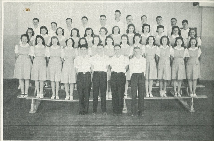
Senior Mixed Glee Club.

The Senior Mixed Glee Club grew from a membership of a few students in 1939 to the group pictured above. This group specialized in a cappella music and appeared on many programs during the year.