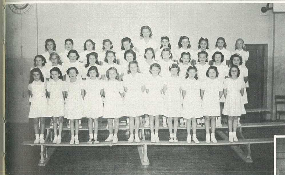
Junior Girls' Glee Club.

The Junior Girls' Glee Club alternated rehearsals with the Mixed Junior Glee Club before school each morning during the year. They worked untiringly on music of outstanding composers, and received thorough preparation for entrance into the High School Choral Groups.