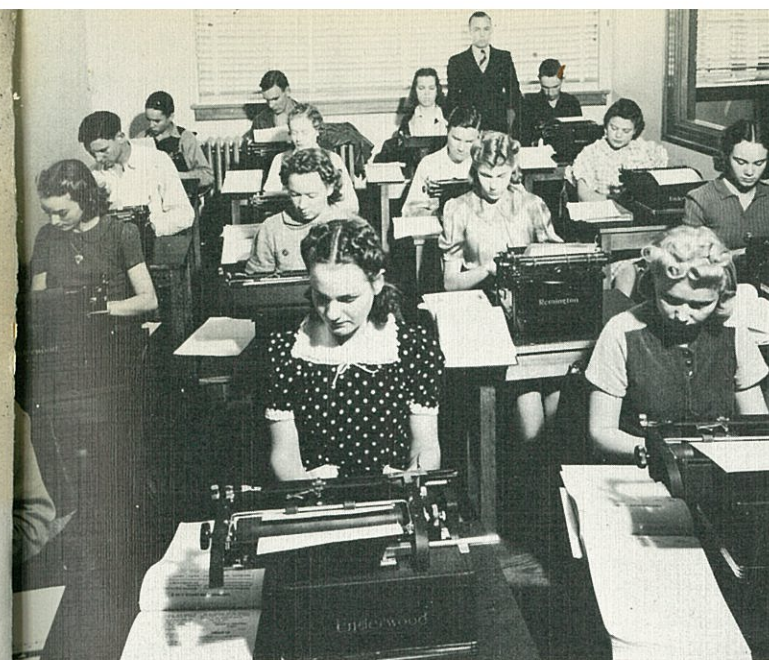
A class in typewriting.