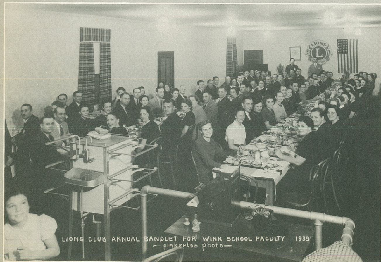
LIONS CLUB ANNUAL BANQUET FOR WINK SCHOOL FACULTY 1939

Below is a picture of our library, a place where "one who seeks may find". Besides many valuable and interesting books, there are current magazines and newspapers for those who care to read them.