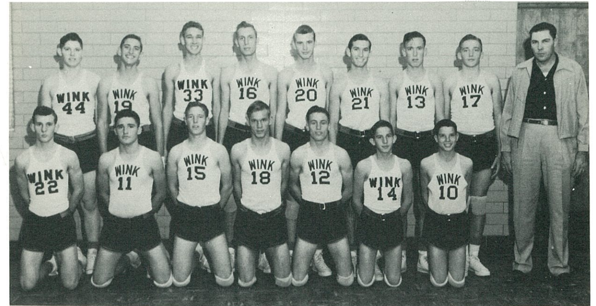
High School Squad