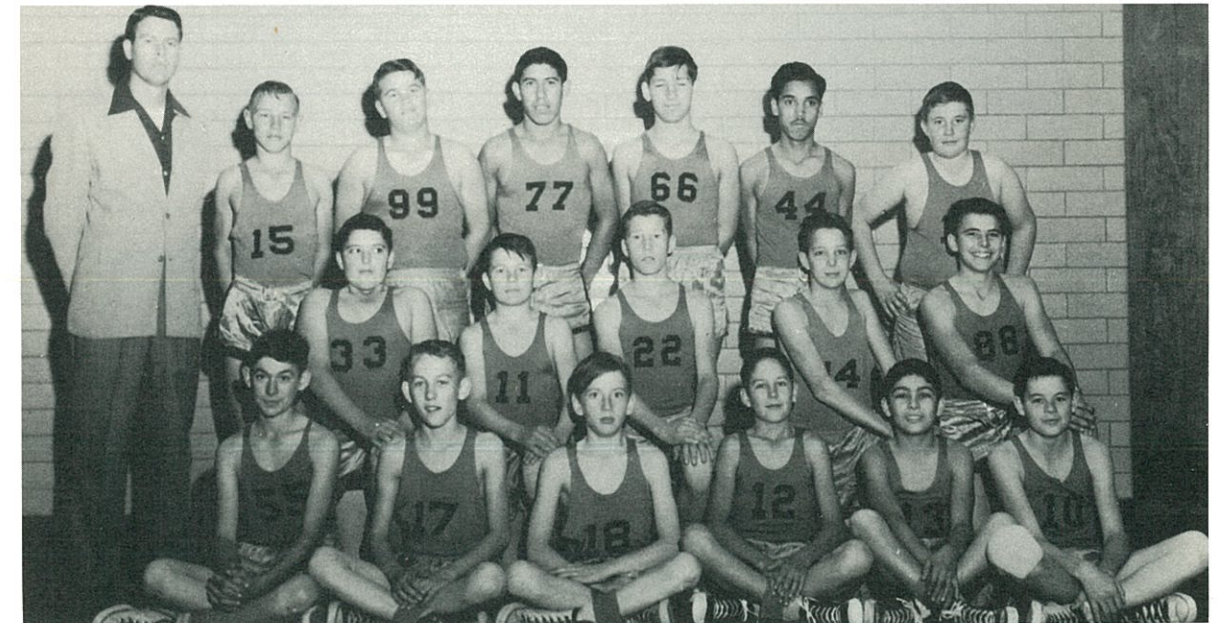
Jr. High Squad