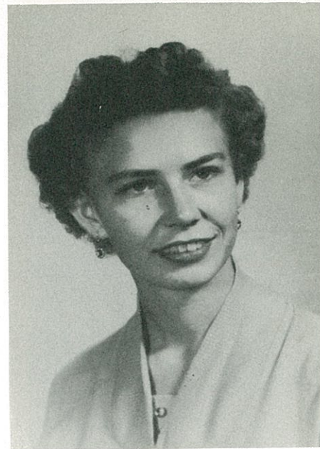
Helen Genee Morton DAR Citizenship Award