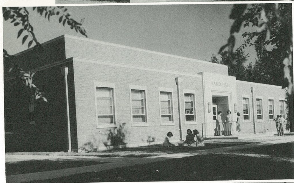
B a n d H a l l