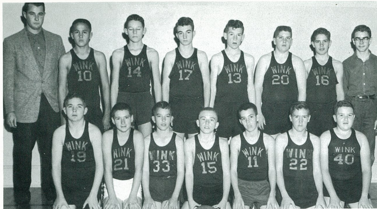
EIGHTH GRADE BASKETBALL