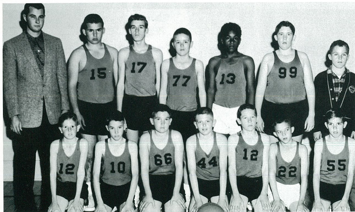
SEVENTH GRADE BASKETBALL