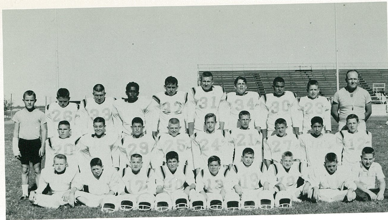
EIGHTH GRADE KITTENS