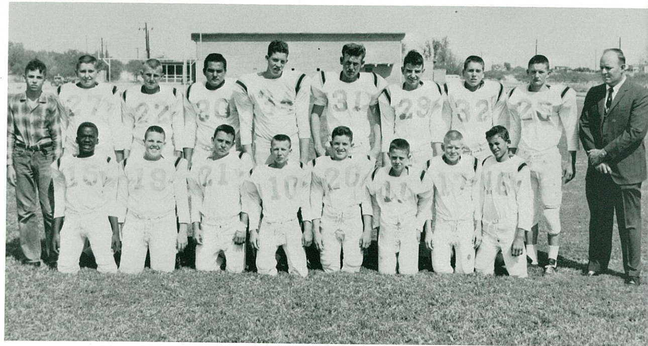
8th Grade Kittens