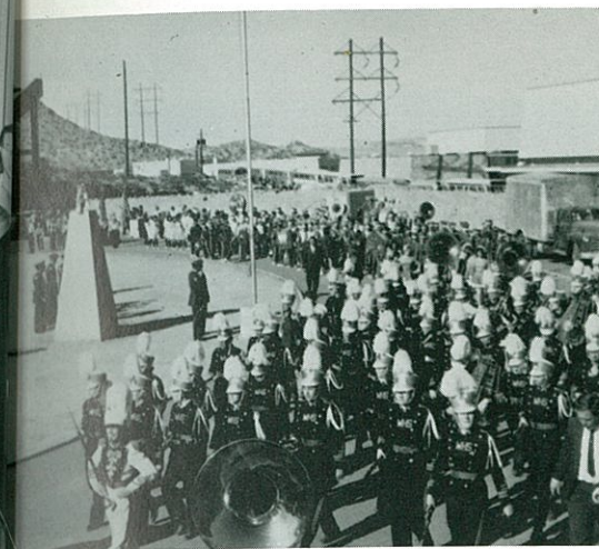
Marching Onto The Field At The Sun Bowl.