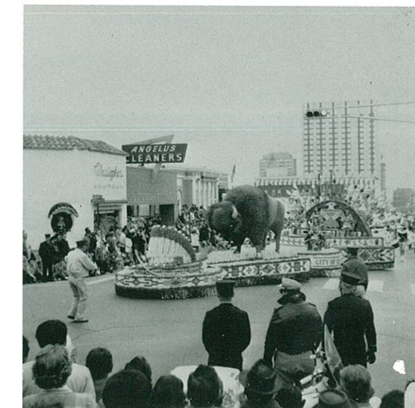
One Of The Beautiful Floats In The Sun Carnival Parade.