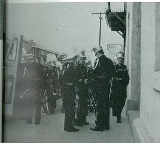
Getting Ready To March In The Parade.