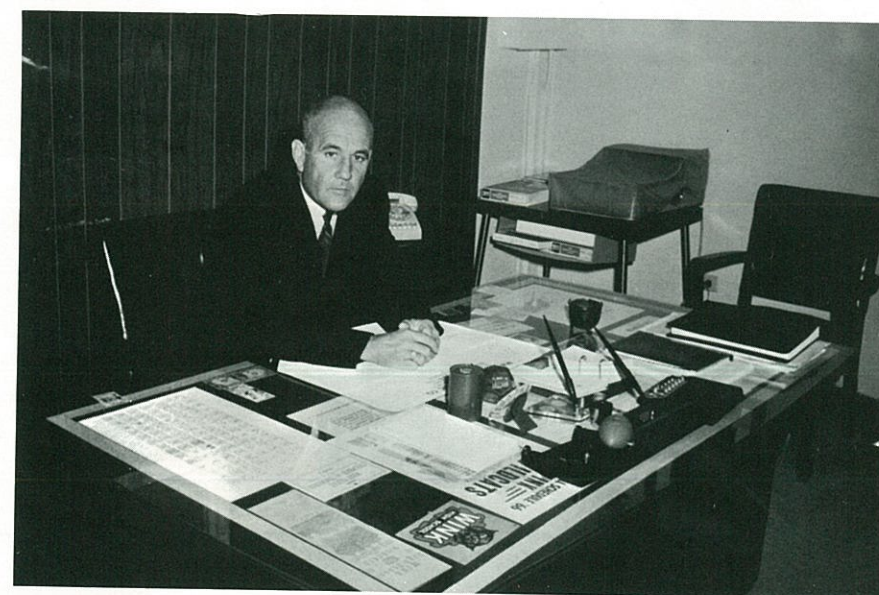
A man of many responsibilities.