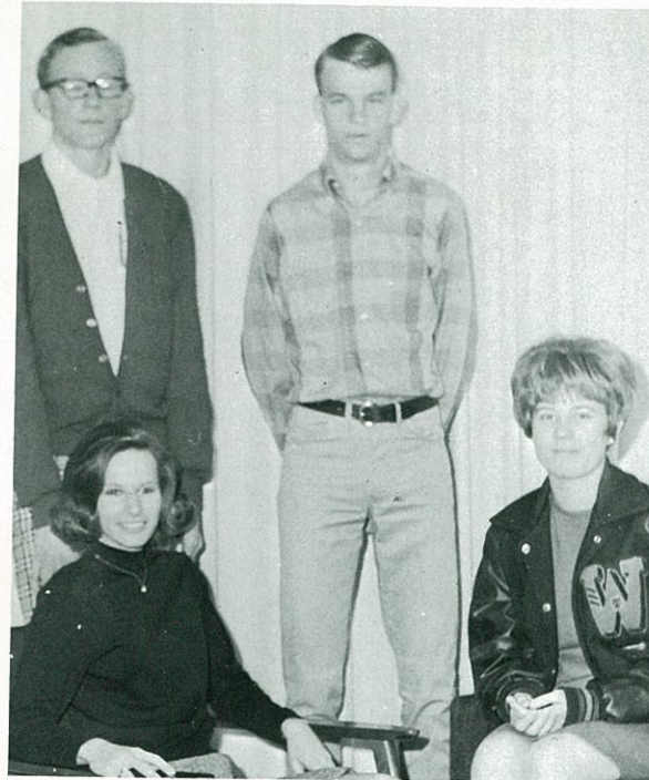
One Act Play

This group represents some of the many students in our school who work very hard in competition for personal glory and to bring honor to our school.